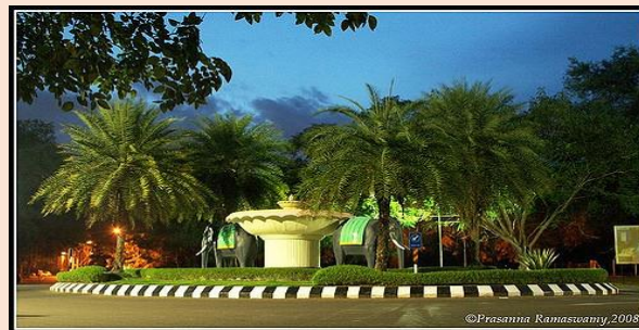
Gajendra Circle (GC) , IIT Madras